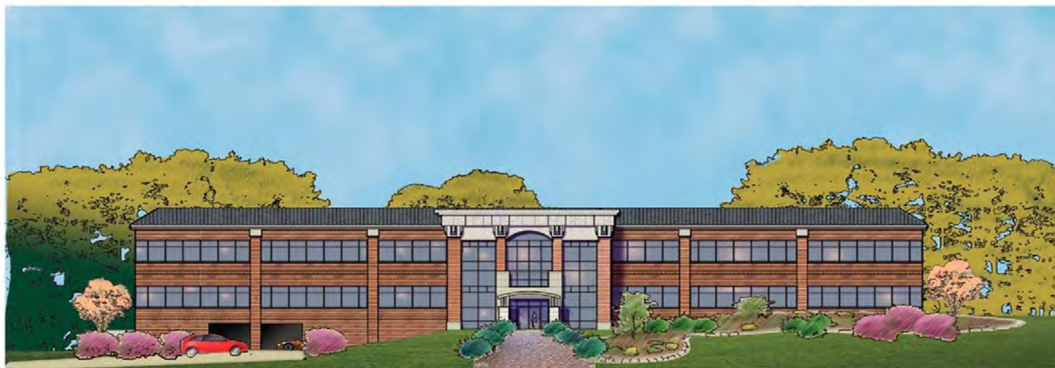
Building 14 – with Underground Parking