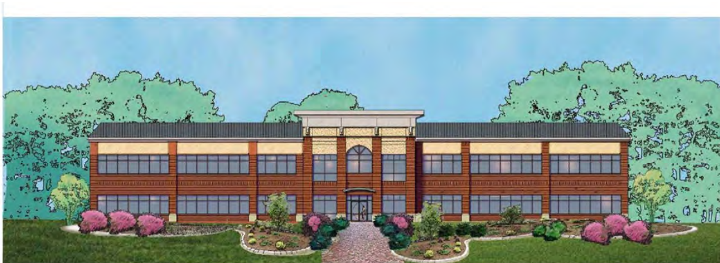
Building 14 – No Parking Garage