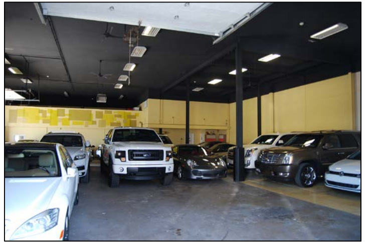
Warehouse From Back

Information contained herein has been obtained from the owner of the property or from sources deemed reliable. We have no reason to doubt its accuracy but make no warranty or representation. All information is submitted subject to errors, omissions, change, withdrawal without notice and any special listing conditions of the owner.