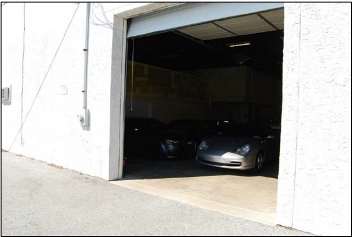
12' x 12' Drive-in Door