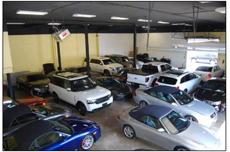
Warehouse From Mezzanine Stairs