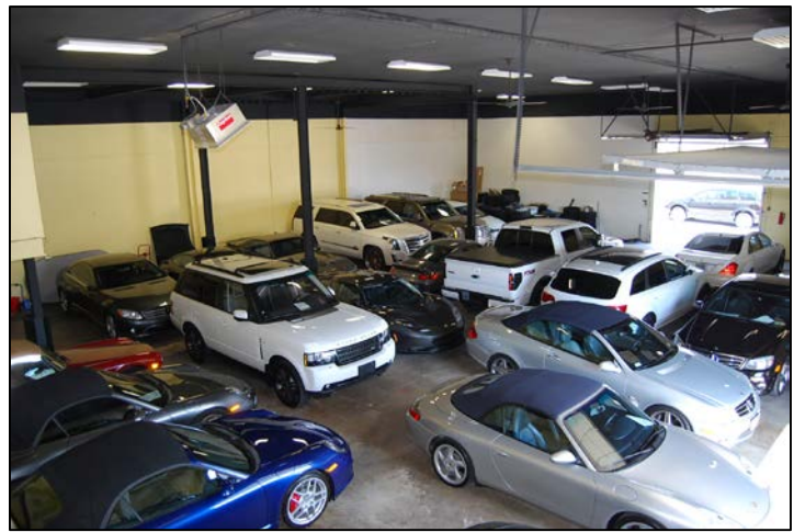
Warehouse From Mezzanine Stairs