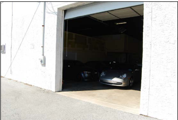
12' x 12' Drive-in Door