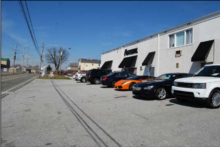
427-431 South Bolmar Street