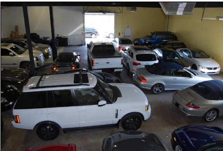
Warehouse From Mezzanine