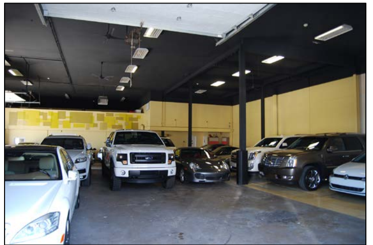
Warehouse From Back

Information contained herein has been obtained from the owner of the property or from sources deemed reliable. We have no reason to doubt its accuracy but make no warranty or representation. All information is submitted subject to errors, omissions, change, withdrawal without notice and any special listing conditions of the owner.